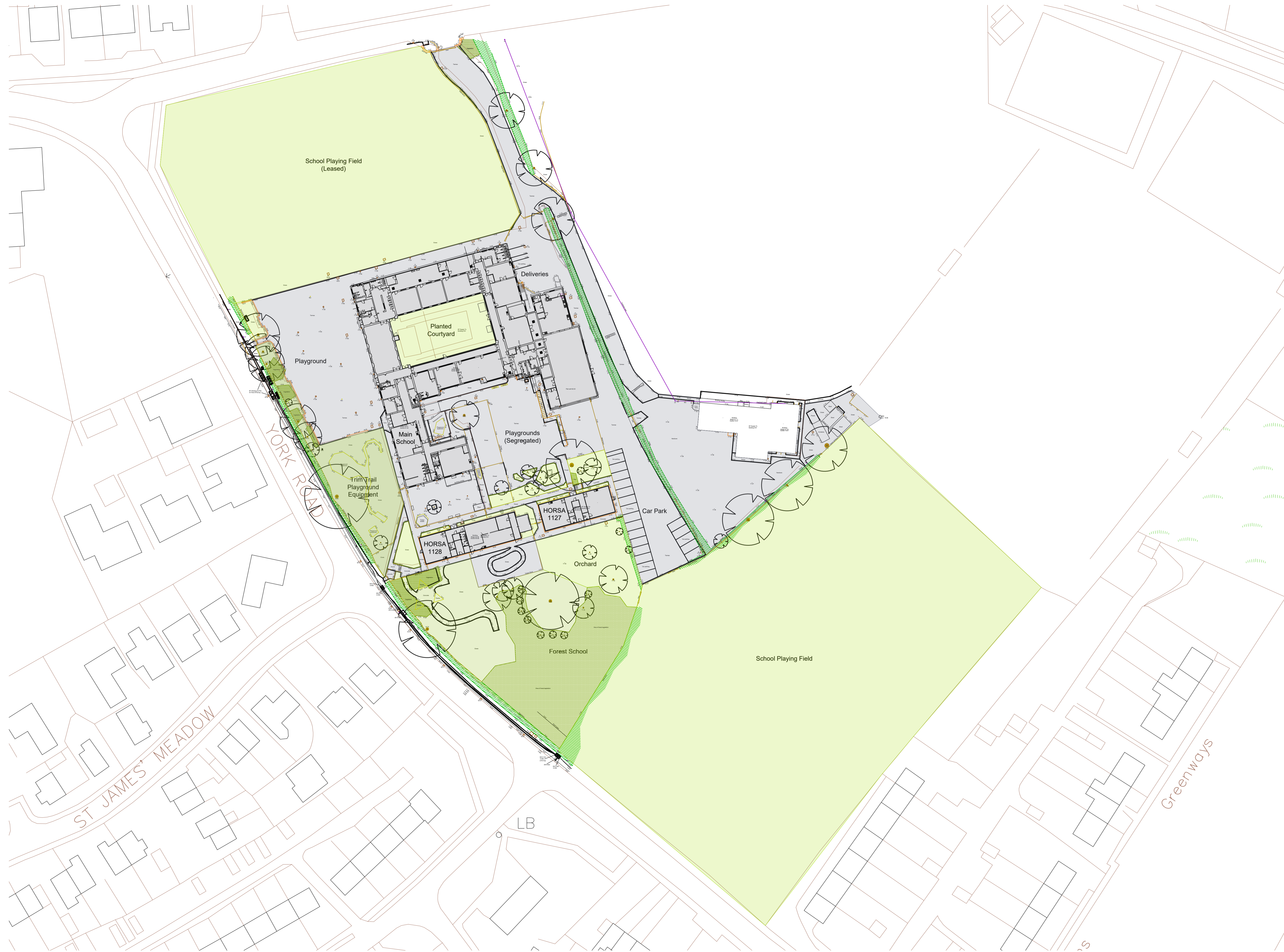
Existing Site Plan SCALE 1:500

Notes This Drawing is an instrument of service and shall remain the property of Align Property Partners Ltd copyright ©. It may not be reproduced or copied in any form. It shall not be used for the construction, enlargement or alteration of a building or area other than the said project without the authorisation of the issuing office. Contractors shall verify and be responsible for all dimensions and conditions and shall report any discrepancies to the issuing office before proceeding with any work. Drawings shall not be scaled.